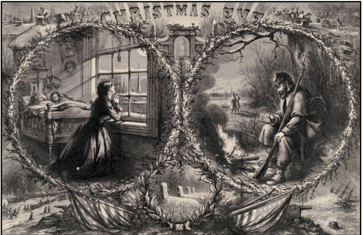
"Christmas Eve" by Thomas Nast, Harper's Weekly , January 3, 1863