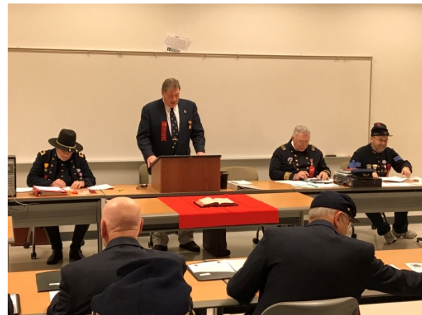
ALTAR WITH DEPARTMENT OFFICERS