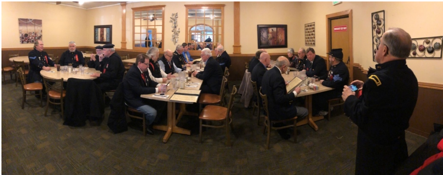
LUNCH AT THE VIKING CHILI BOWL