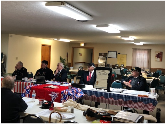
2018 Midwinter Encampment Altar and Commander Table