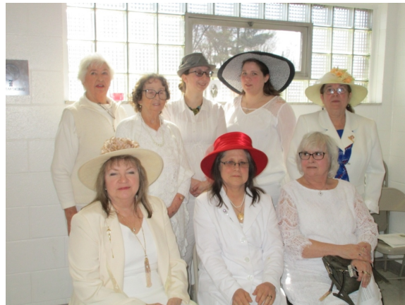
Ladies of the LGAR Arsinoe Martin Circle #78 – Goshen, IN