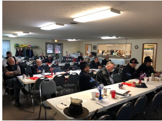
2018 Midwinter Encampment Attendees