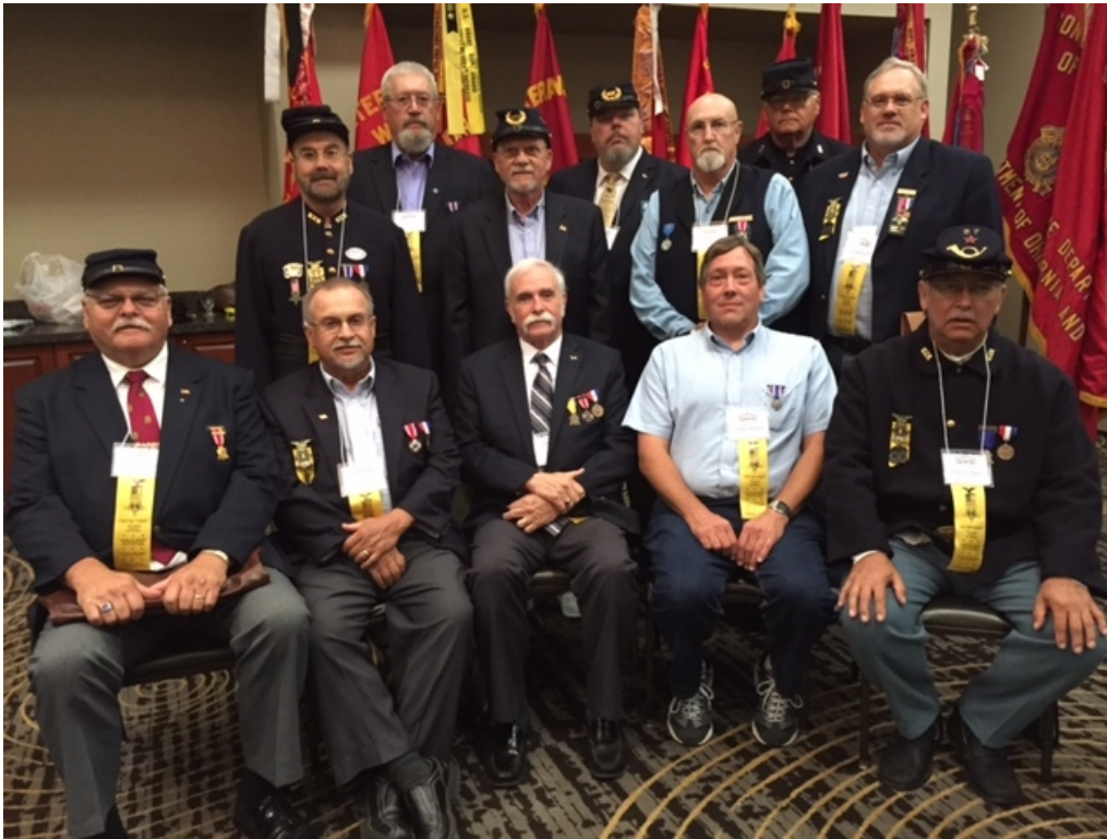
Dept. of Indiana Delegation at the SUVCW National Convention, Lansing, MI - 8/11/2017