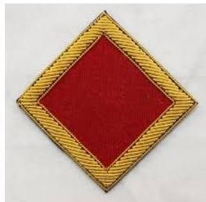
First Division Third Corps Army of the Potomac