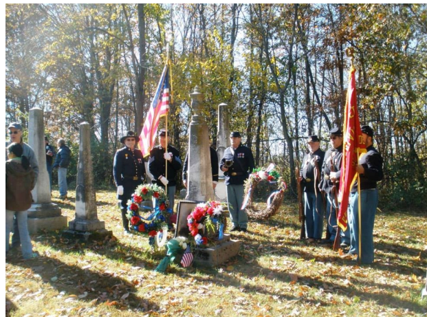
27 th Indiana SVR