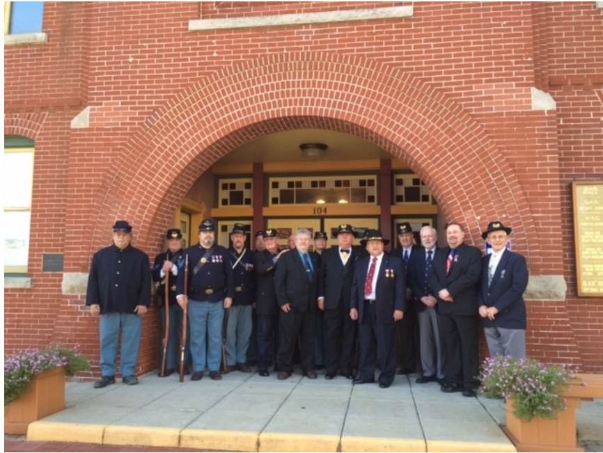
Proud members of Porter Camp 116 and the Dept. of Indiana stand in front of the Opera House.

Roosevelt, John Phillips Sousa and the Marx Brothers. The building was listed on the National Register of Historical Landmarks in 1984.