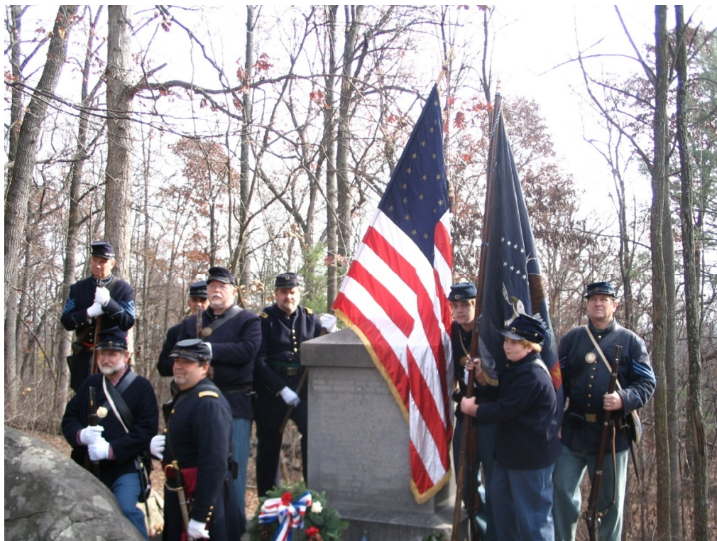
The 20 th Maine Infantry at Gettysburg