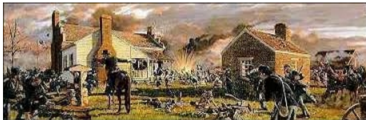
Battle of Franklin November 1864

THE BEST WAY TO GET TO THE CHAPEL IS TO DRIVE WEST ON HWY 26 FROM WEST LAFAYETTE INDIANA. SHORTLY AFTER CROSSING THE TIPPECANOE COUNTY/WARREN COUNTY LINE YOU WANT TO TURN SOUTH ON 1100 E. A SHORT DRIVE WILL FIND THE ARMSTRONG CHAPEL SITTING ON THE WEST SIDE OF THE ROAD. COMING FROM THE SOUTH OR NORTH ONE SHOULD TAKE HWY 41 THROUGH WARREN COUNTY TO HWY 26. THEN TURN EAST UNTIL YOU MEET 1100 E.