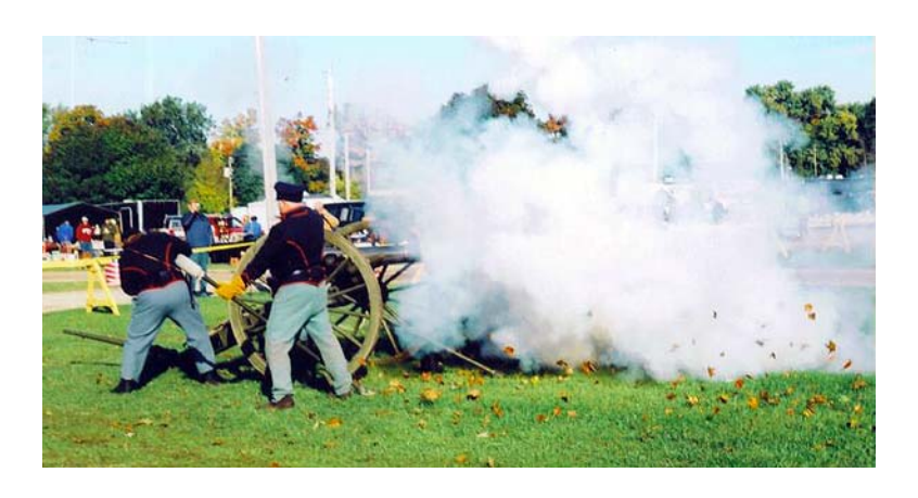
Robinson's Battery firing an 1861 6-pounder at the Centreville show.