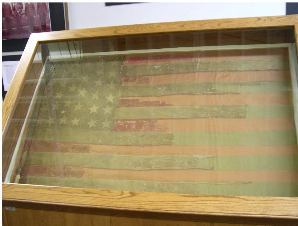
Company K, 27 th Indiana Volunteer Infantry Flag