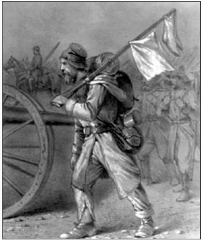
Washing Day, Column on the March, 5 May 1865. Detail of a period drawing by Edwin Forbes.