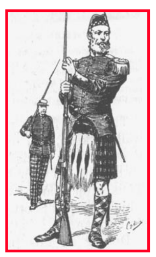
The 79th New York uniform before the first Bull Run. Apparently plain blue pants were worn into the battle.