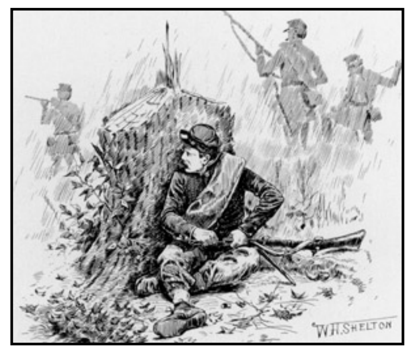
On the skirmish line

There are many other reference works dealing with the Civil War, but this one is essential, not only for our bookshelf or desk, but for the hands of the next generation.