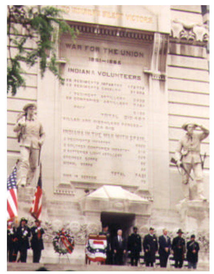
A reminder of the sacrifices of the sons of Indiana in the War for the Union

The Anniversary of the Dedication of the Soldiers and Sailors Monument Indianapolis, Indiana 11 May 2002