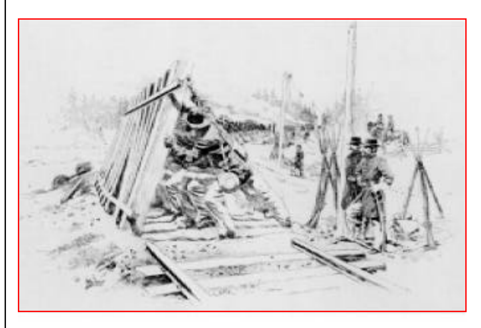
Sherman's men tearing up track in the Carolinas, a drawing by Walton Taber