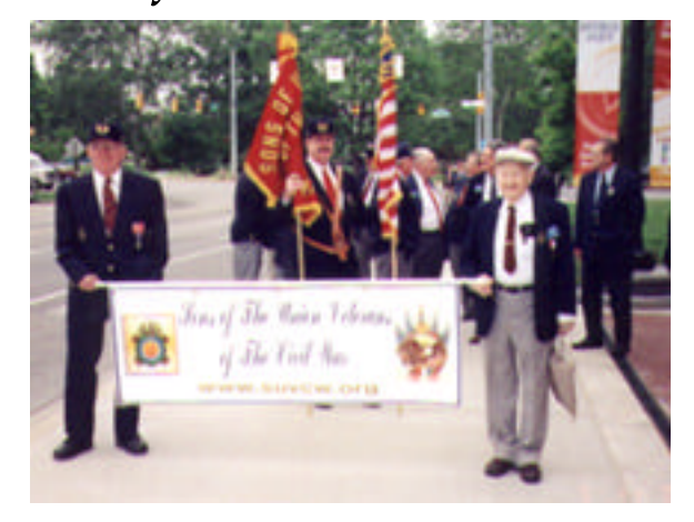
"Hurry up and wait" at the start of the march in front of the Historical Society