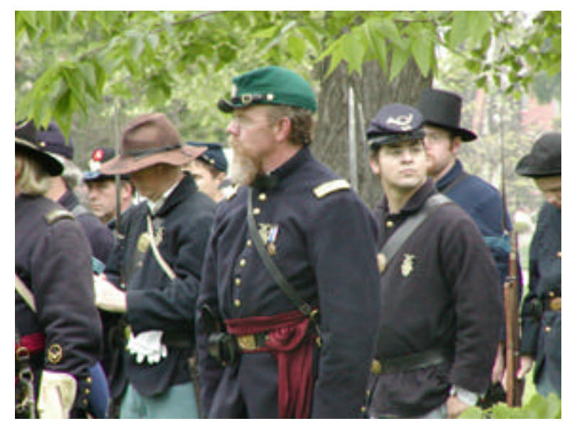
Reenactors looking every bit like ghosts of the past