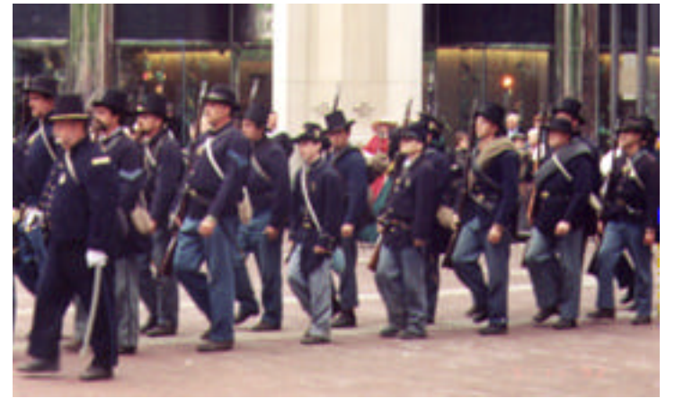
More "ghosts" approach the monument.