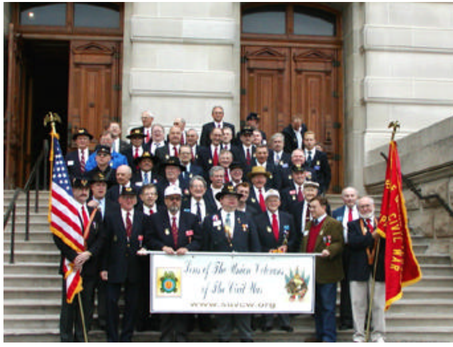
The Department marchers pose for a photograph at the north side of the state capitol