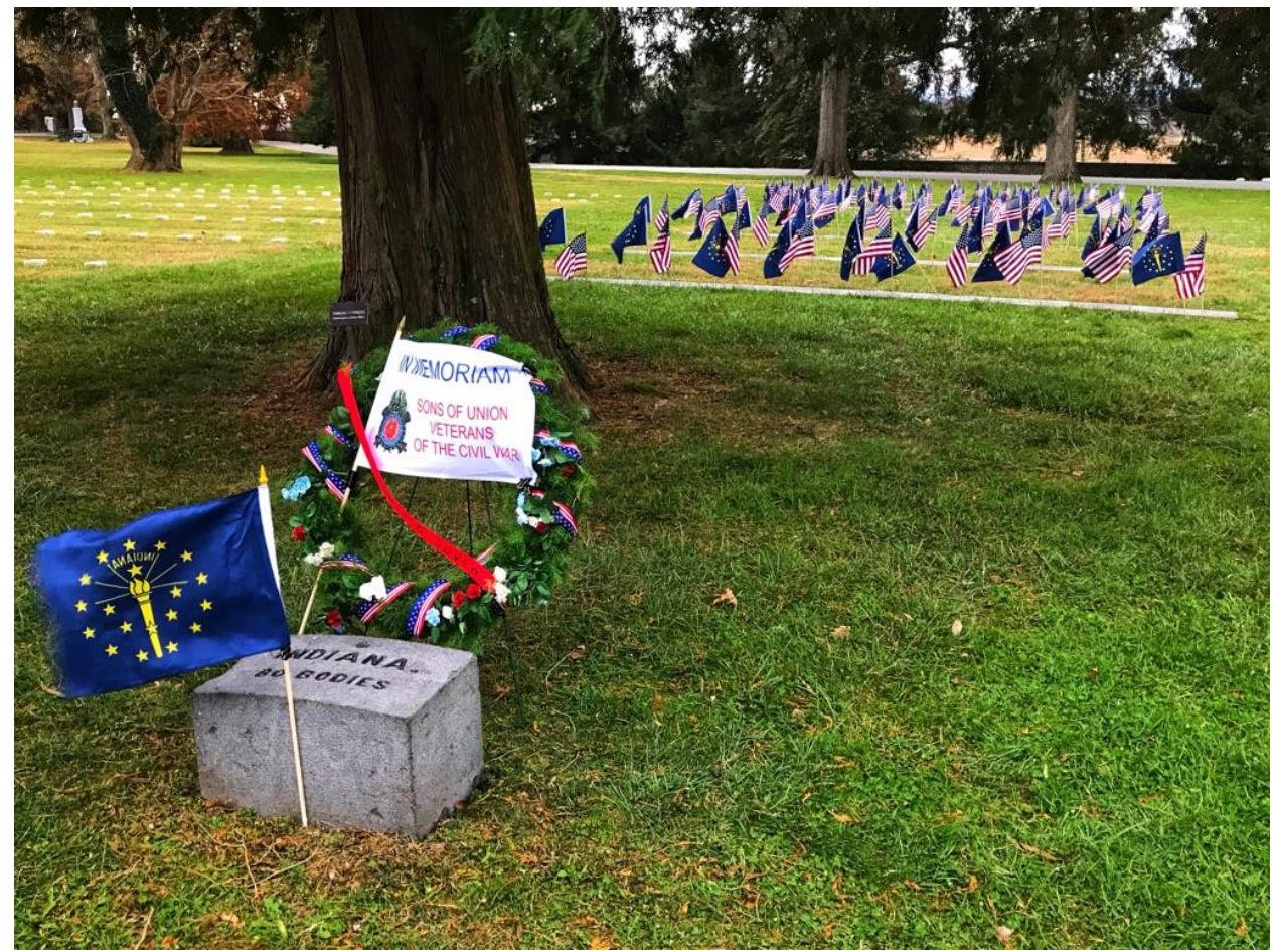
Indiana Section - Soldiers' National Cemetery, Gettysburg, PA.

The National Encampment discussion will be: Does the SUVCW National Organization file a permit with the National Park Service to place flags in the Soldiers' National Cemetery for Remembrance Day? (Gettysburg National Military Park stated they would provide the flags), and if a permit is filed and approved, who/what will the flag placement work detail be?