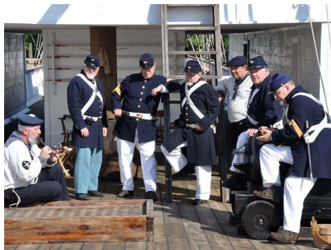
Two Sailors equal Five Marines – Seems Right