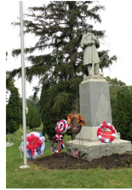
Last Soldier Ceremony and Monument Rededication - New Carlisle Cemetery