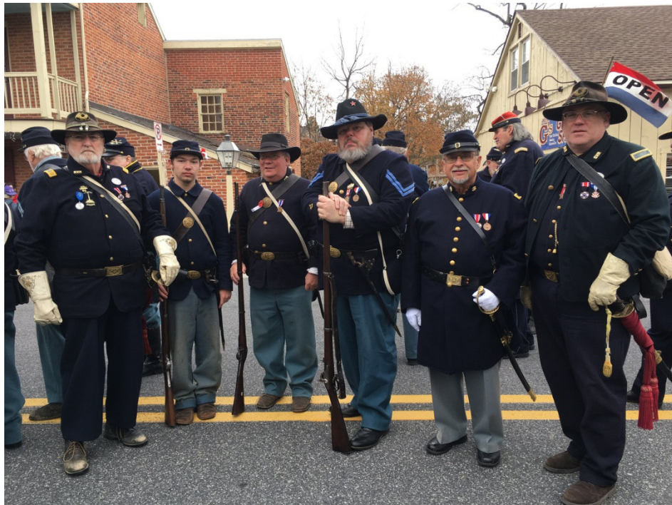
Members of Co. D, 27th Indiana S.V.R. Before Parade